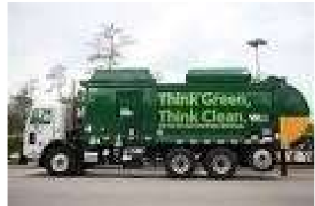
Municipal Corporation in order to save money gives contract to the private companies for the collection of garbage.

One of the important functions of the municipal corporation is to keep the city clean. This is done by appointing sweepers who clean the streets and roads of various localities. The collection and disposal of garbage is an important part of keeping the city clean. Nowadays, the municipal corporations in order to cut the cost of garbage collection, hire many private contractors who collect and process the garbage. This system is called sub contracting . In this system of sub contracting, the private company carries out the work which was earlier done by the government. The municipal corporation of the city of Surat has done a recommendable work in cleaning the city of its garbage after the breakout of plague in 1994.