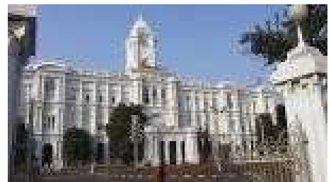
The building of the Chennai Municipal Corporation. It is the oldest Municipal Corporation in India.