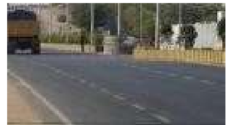
One of the main functions of the municipal corporation is the construction and maintenance of roads.